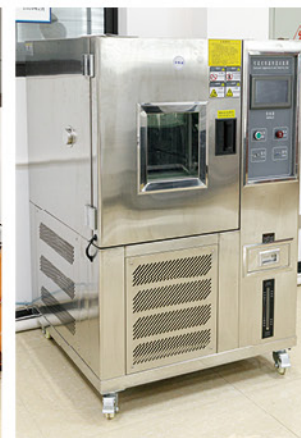
◎ 环境温度测试仪 Ambient temperature tester