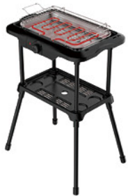
ELECTRIC BBQ GRILL