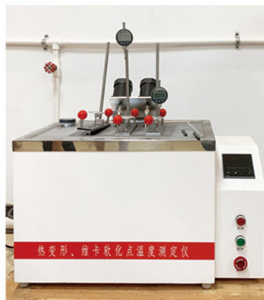
◎ 热变形维卡测试仪 Thermal Deformation Vicat Tester