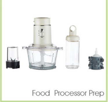
Food Processor Prep