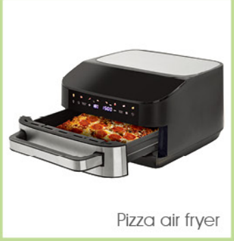
Pizza air fryer