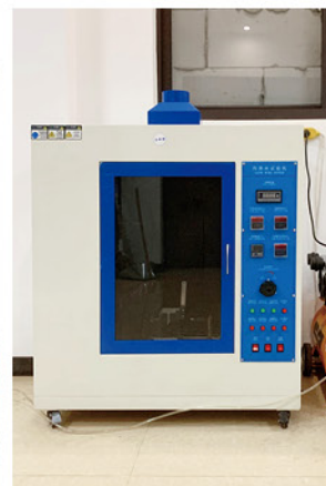
◎ 灼热丝测试仪 Glow Wire Tester