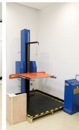
◎ 跌落测试仪 Drop testing machine