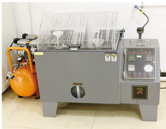
◎ 盐雾测试器 Salt spray test machine