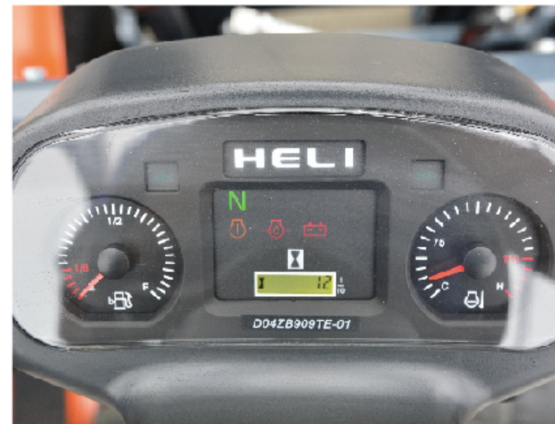
液晶仪表 LCD meters