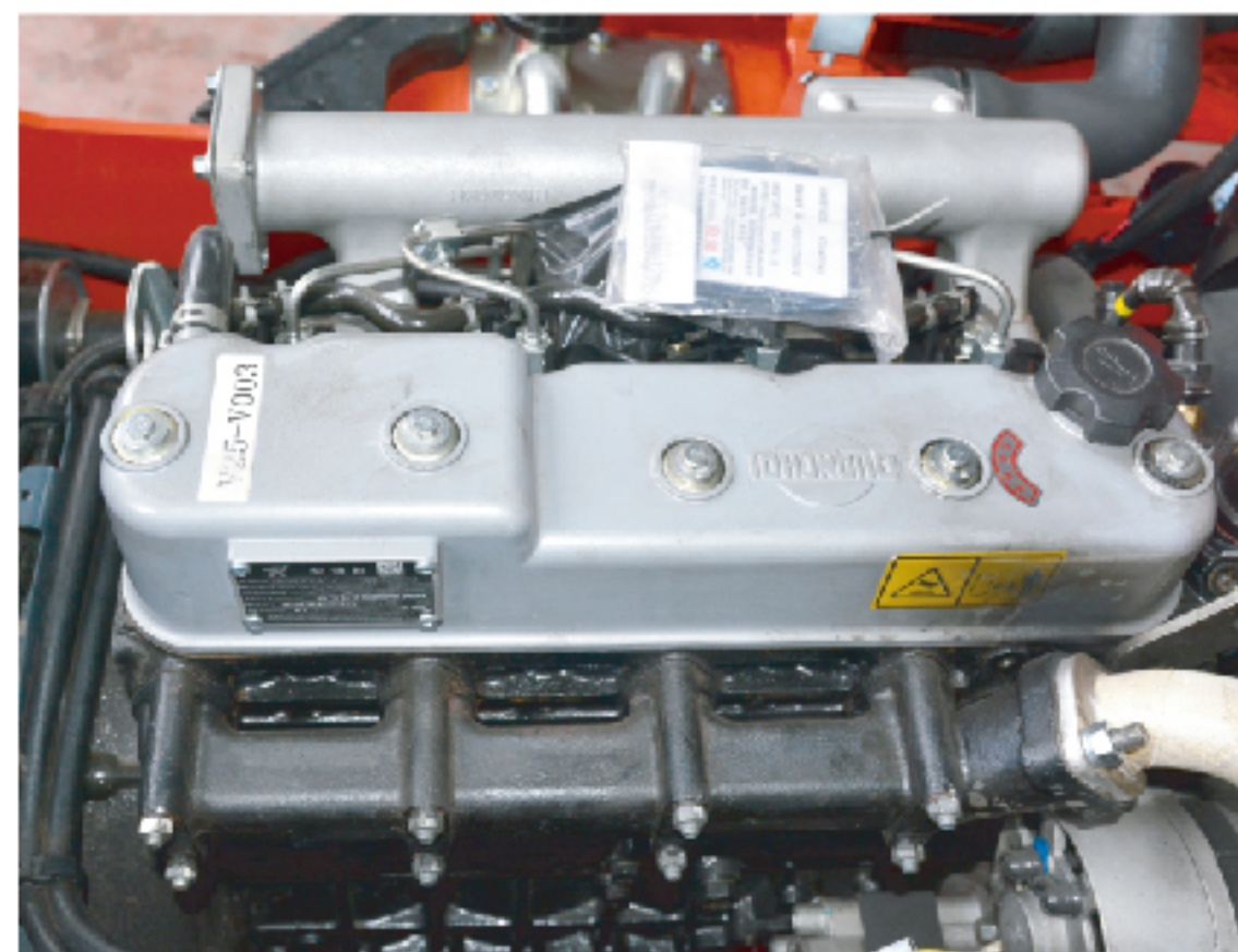
国四排放动力 Power of emission