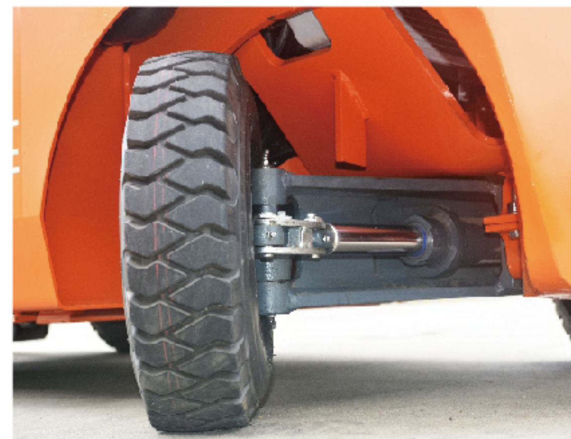
可靠的转向桥 Reliable steering bridge