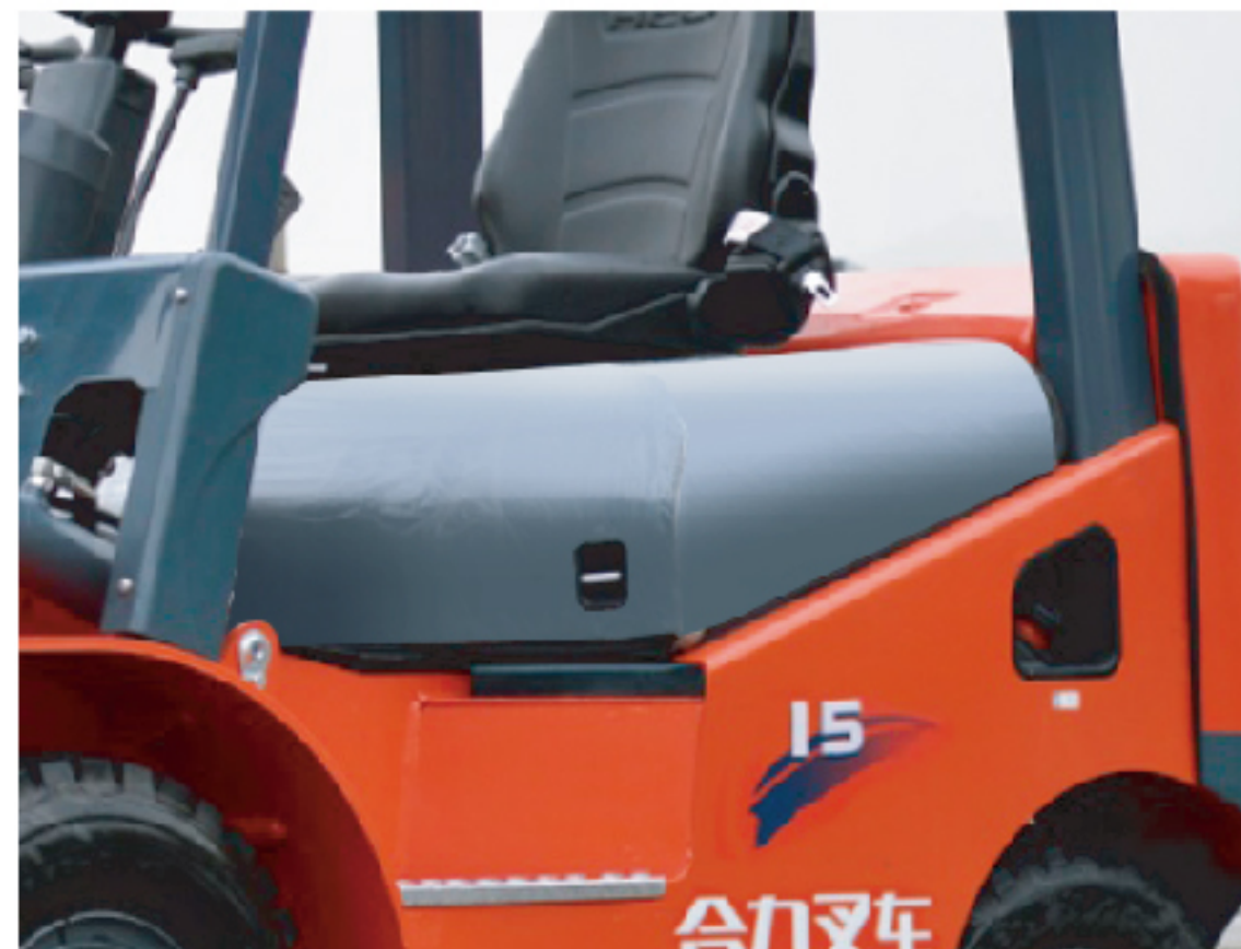
新式机罩 The new hood