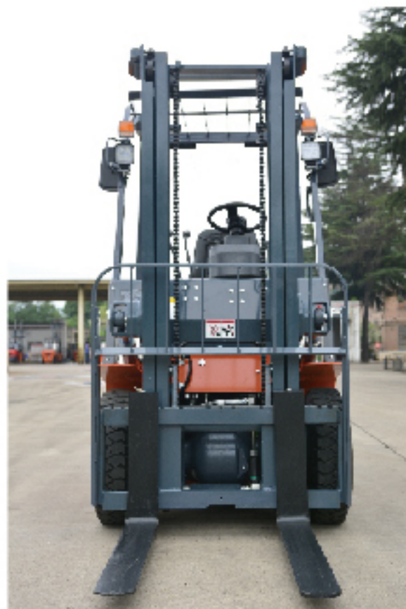
宽视野门架 Wide view mast