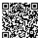
T800-EX 3D demo