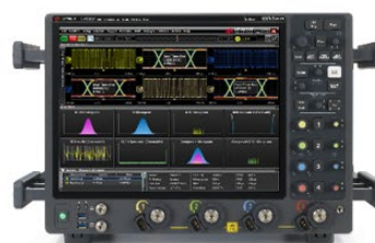
3.5 mm input models