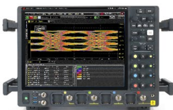
1.85 mm input models