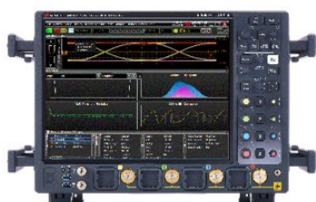
1 mm input models

The UXR is available in three models based on bandwidth, sample rate and input connector size. Infiniium UXR-Series models offer bandwidths from 5 GHz to 110 GHz with various 1-channel, 2-channel, or 4-channel configurations available. The 3.5mm models are equipped with Keysight AutoProbe II interfaces while 1mm and 1.85 mm models incorporate an advanced high-performance high-bandwidth Keysight AutoProbe III interface.