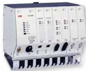
AC 800F Controller

It is suitable for very small applications from 16 to 256 I/Os and thereby widens the Freelance 800F application area ranging from very small to midsize projects with several thousands of signals.