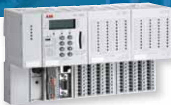
AC 700F Controller with direct S700 I/O