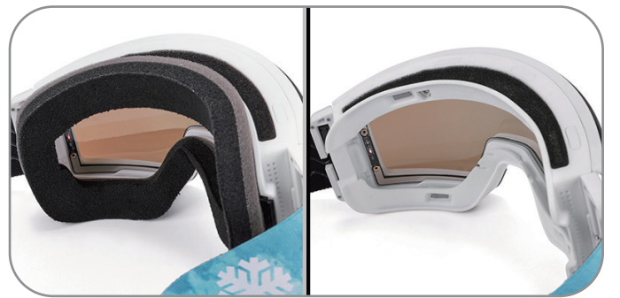
removable magnetic high-density foam