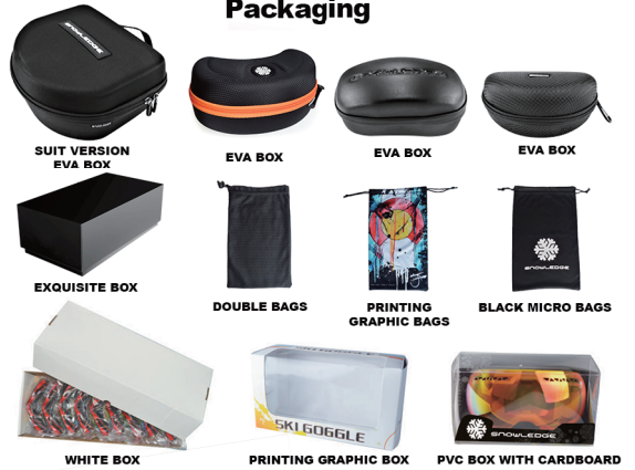
SUIT VERSION EVA BOX