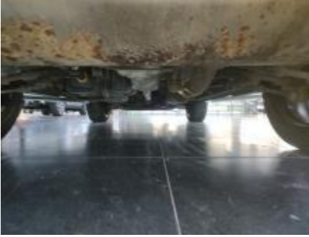
Body floor: restricted and not inspectable