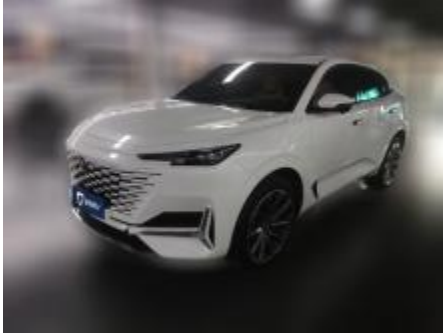
Left front 45°