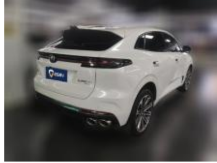
Right rear 45°