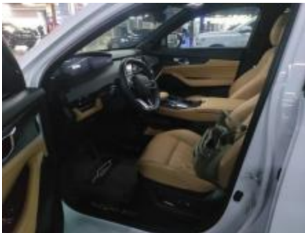
Main and passenger seats (front seats)