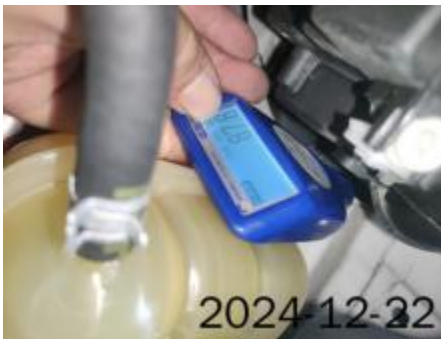
Right front wing inner structure