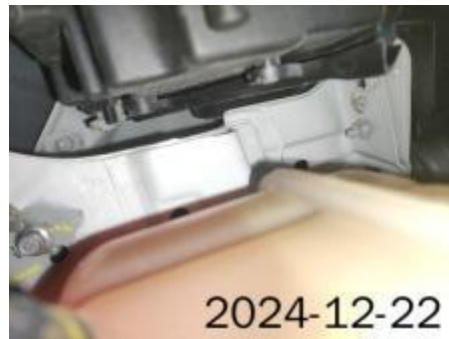
Right front wing inner structure