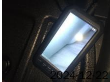
Right rear wing inner structure