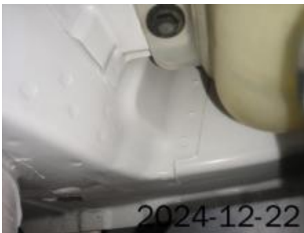
Right front wing inner structure