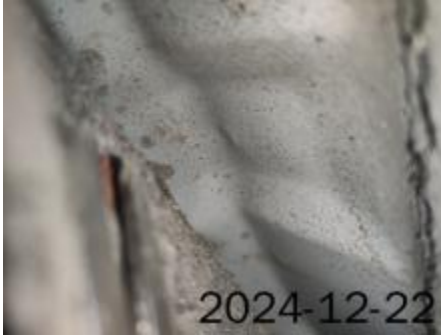
Right rear wing inner structure