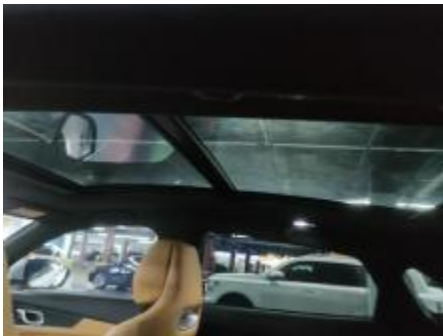
Roof top window