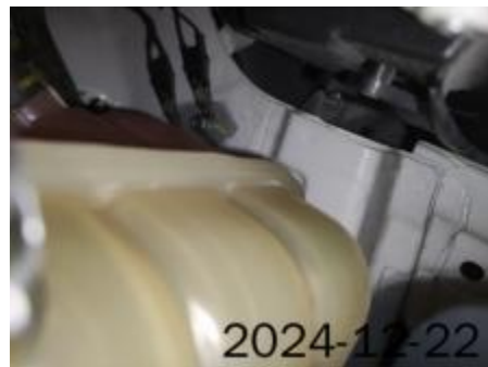
Right front wing inner structure